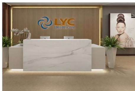
The share purchase yields an implied valuation of RM10mil for EDTSB, LYC stated in its exchange filing yesterday. The brands operating under EDTSB include PrimeCare Dental Clinic, Signature PrimeCare Dental and Lite Dental

PETALING JAYA: LYC Healthcare Bhd's wholly-owned subsidiary LYC Dental & Aesthetic Holdings Sdn Bhd has entered into a conditional share purchase agreement with Elite Dental Team Sdn Bhd (EDTSB) to acquire 178,200 ordinary shares or a 55% stake for RM5.5mil cash.